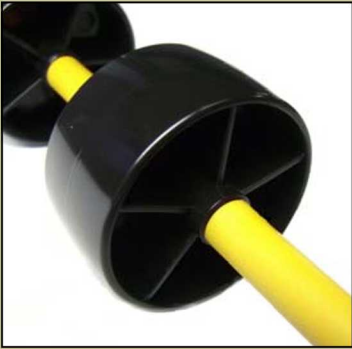
Large 1.9" diameter X 1" wide rollers

Skatewheel style carton flow ... the most flexible carton flow available